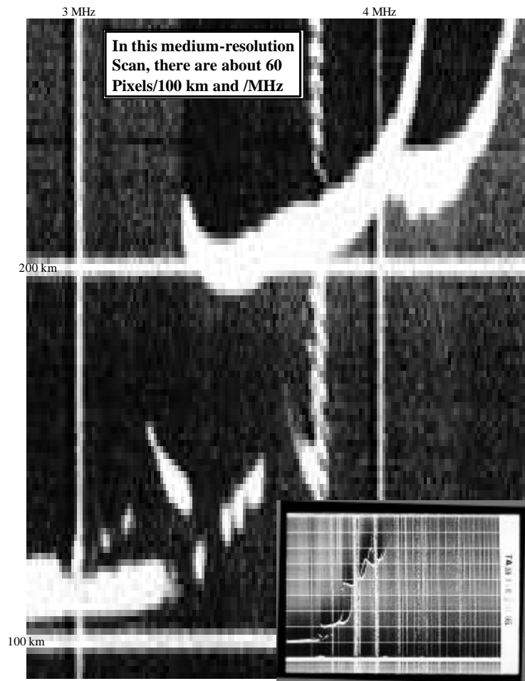
Fig. 1 (Insert) Grayscale scan of analog ionogram including Station, Date, Time stamp. (Main part) Zoomed part of E, lower F-regions showing resolution achieved.

Figure 2 is from an ionogram scanned in this manner, and with black and white interchanged. The scanning was kindly performed as a demonstration using modern industrial equipment by Ronsin Imaging ( www.ronsin.com ). They used a scanning resolution of 300 dpi, resulting in a ‘.tif’ file size of 660 kB. Individual pixels may be just barely visible in the zoomed insert of Fig. 2. In a step not shown here, Ronsin applied a commercial software package ( TMS Sequoia’s SCANFIX ) that discards stray unattached pixels; this reduced the file size to 390 kB, with no loss of useful information.